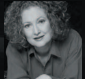
EMMA KIRKBY soprano